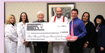
Workers at Winthrop University's Breast Health Team accepting the $3,025 check from Ben's Kosher Delicatessen Restaurant & Caterers.

For more information regarding Winthrop-University Hospital's Breast Health Program, visit www.winthrop.org . And for more details regarding Ben's Kosher Delicatessen Restaurant & Caterers, visit bensdeli.net .